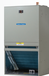
Silver TMM5, TMM4