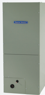
Silver TEM3, TEM4